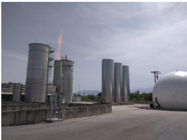
Fig. 1: Picture of an anaerobic wastewater treatment plant in the milk processing industry that SIRMET is designed, constructed and tested for LA FARM S.A. The unit was delivered in April 2017.