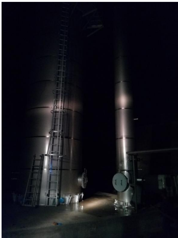
Fig. 2: Picture of an anaerobic wastewater treatment plant in the milk processing industry that SIRMET is constructing for EXARCHOS S.A. (SIRMET has also designed the plant, and will eventually test it). The project is under construction and will be delivered in May 2018.